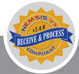
NEMSIS v3 Compliant Collect (ePCR) and Receive & Process (State)