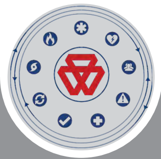
Connected Data Across Providers and Entities

ImageTrend's powerful reporting database gives you the flexibility to quickly and easily create dynamic reports. Monitor key performance indicators (KPIs), set up alerts or triggers, or integrate multiple data sources to reveal the trends in your community. ImageTrend Continuum™ (optional) gives you active data monitoring when, where and how you want it delivered for timely awareness of your operations.